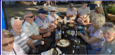
Drinks by the River