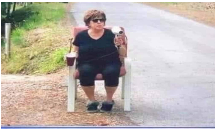
GRANDMA USES BLOW DRYER TO MAKE DRIVERS SLOW DOWN