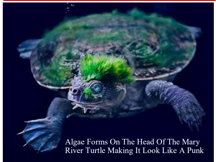
Algae Forms On The Head Of The Mary River Turtle Making It Look Like A Punk