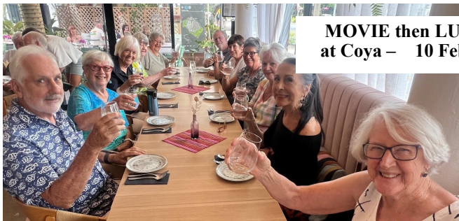
MOVIE then LUNCH at Coya – 10 February