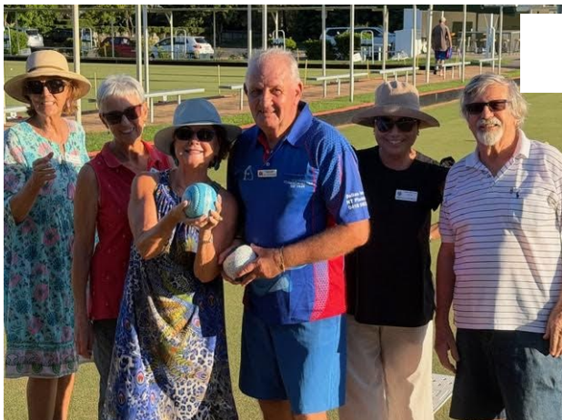
BAREFOOT BOWLS 12 March