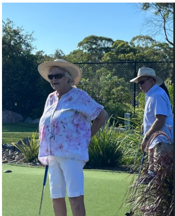
surveying the situation