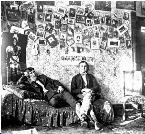
Hanging out in a college dorm in 1910