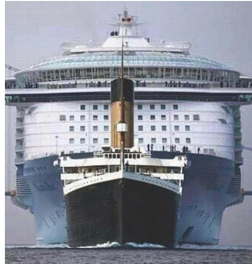
The TITANIC compared to A modern Cruise Liner