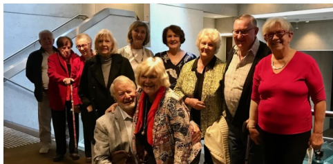
Girl from the North Country group